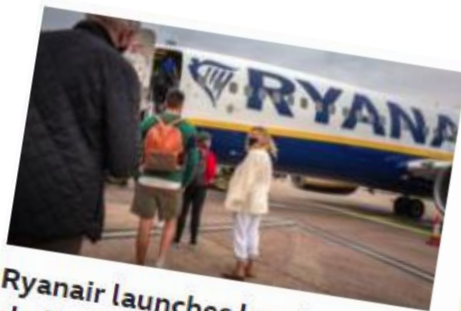
Ryanair launches legal challenge over travel lists

There is anger in the travel sector over how the government has made decisions over the green list.