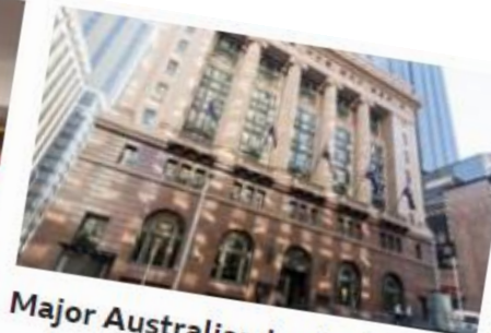
Major Australian banks hit by website outage

Customers were unable to access the websites or apps of several Australian banks amid an outage.