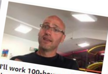
'I'll work 100-hour weeks to clear our Covid debt'

Businesses have run up an "unprecedented" amount of debt in the pandemic, say industry groups.