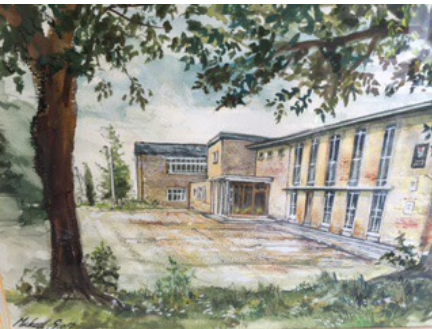
Drawing of Deacon's School in Queen's Gardens.

Deacon's achieved many accolades, including becoming a Specialist Technology College in 1994, Beacon School in 1999 and Leading Edge School in 2002.