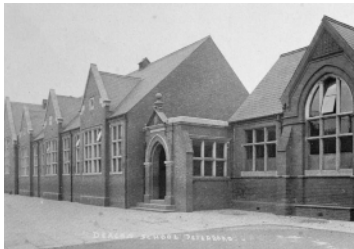
Deacon School on Deacon Street