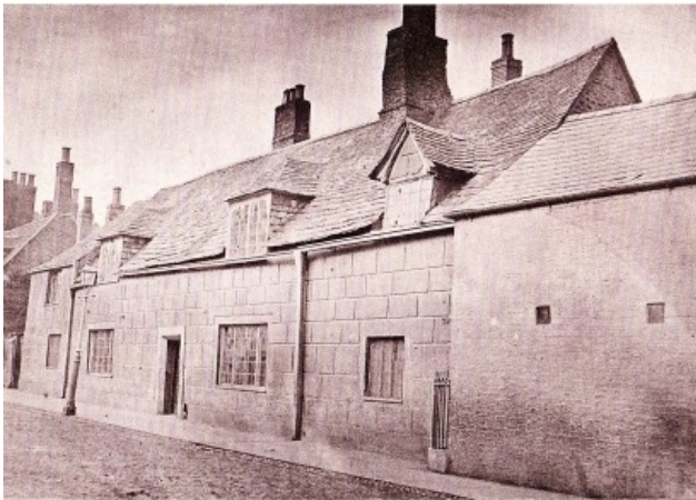
Original school in Cowgate

The school opened in 1722 and remained on site for 161 years until 1883 when it moved to Crown Lane. The site was sold by auction for £3,150.